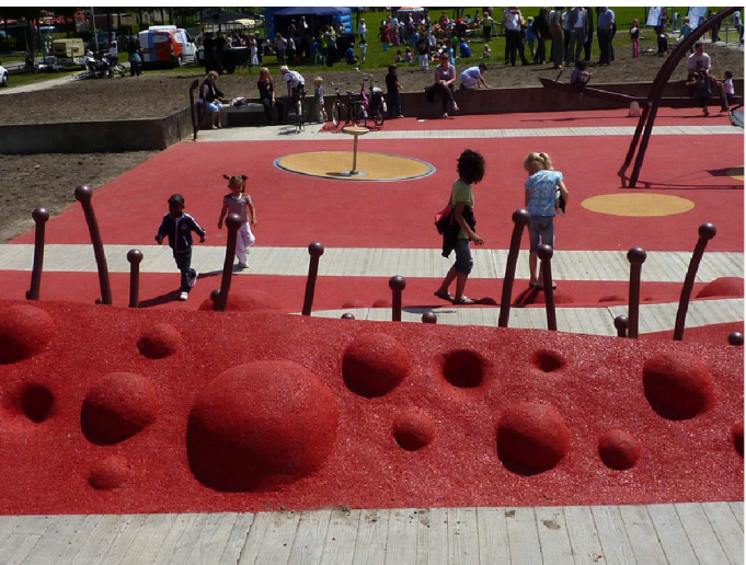
Circle geometric pattern & textured Play Surface