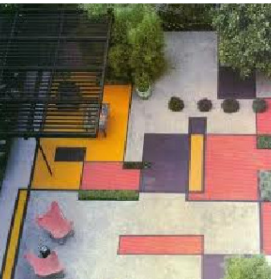
Square geometric pattern inspiration for Sensory Garden