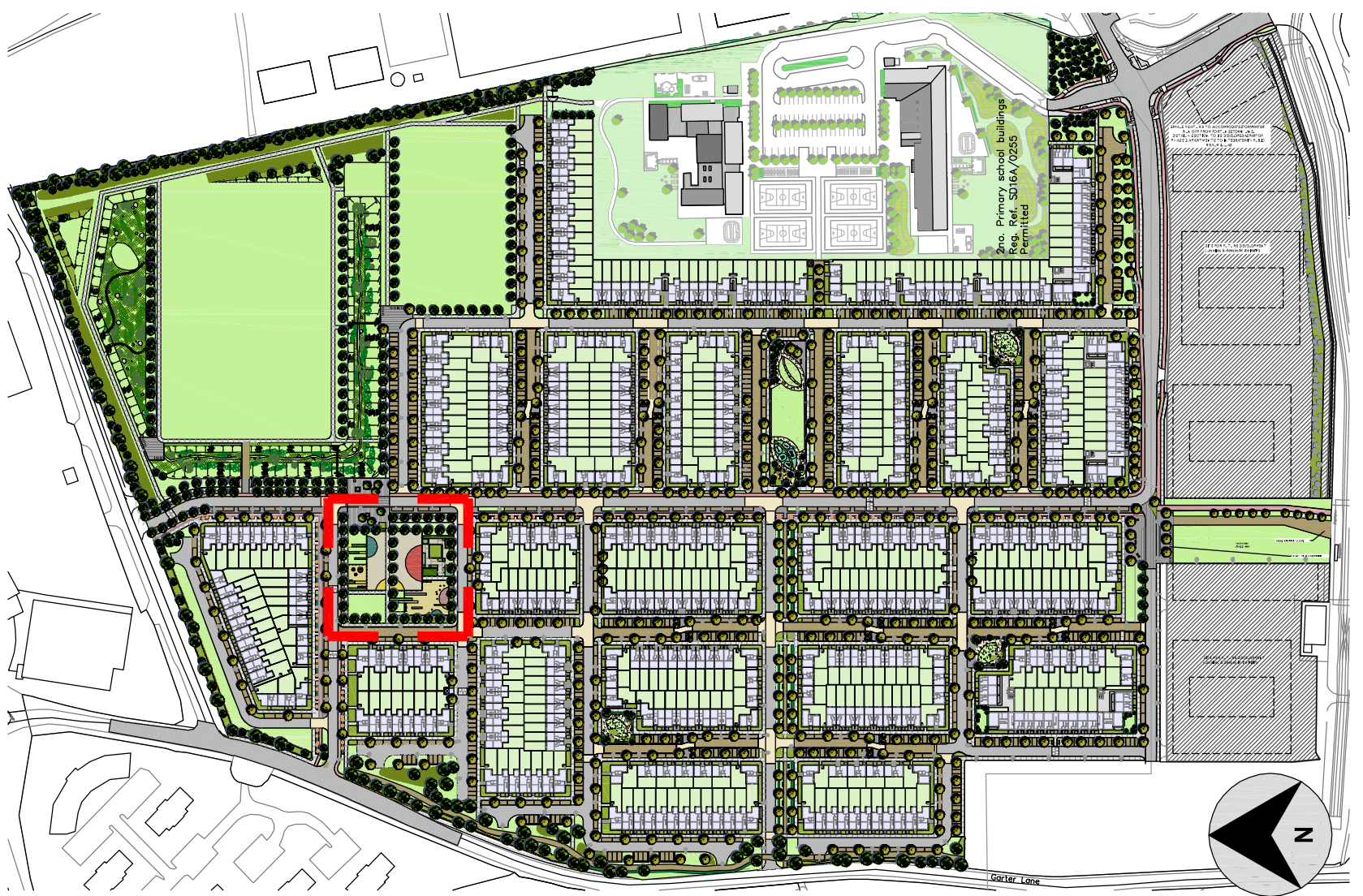
DISTRICT PARK - PLAYSCAPE LOCATION PLAN - N.T.S