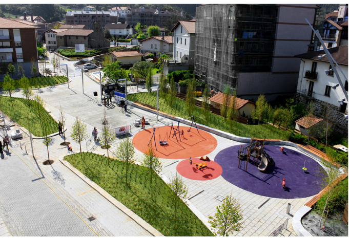
Circle geometric pattern & urban furniture