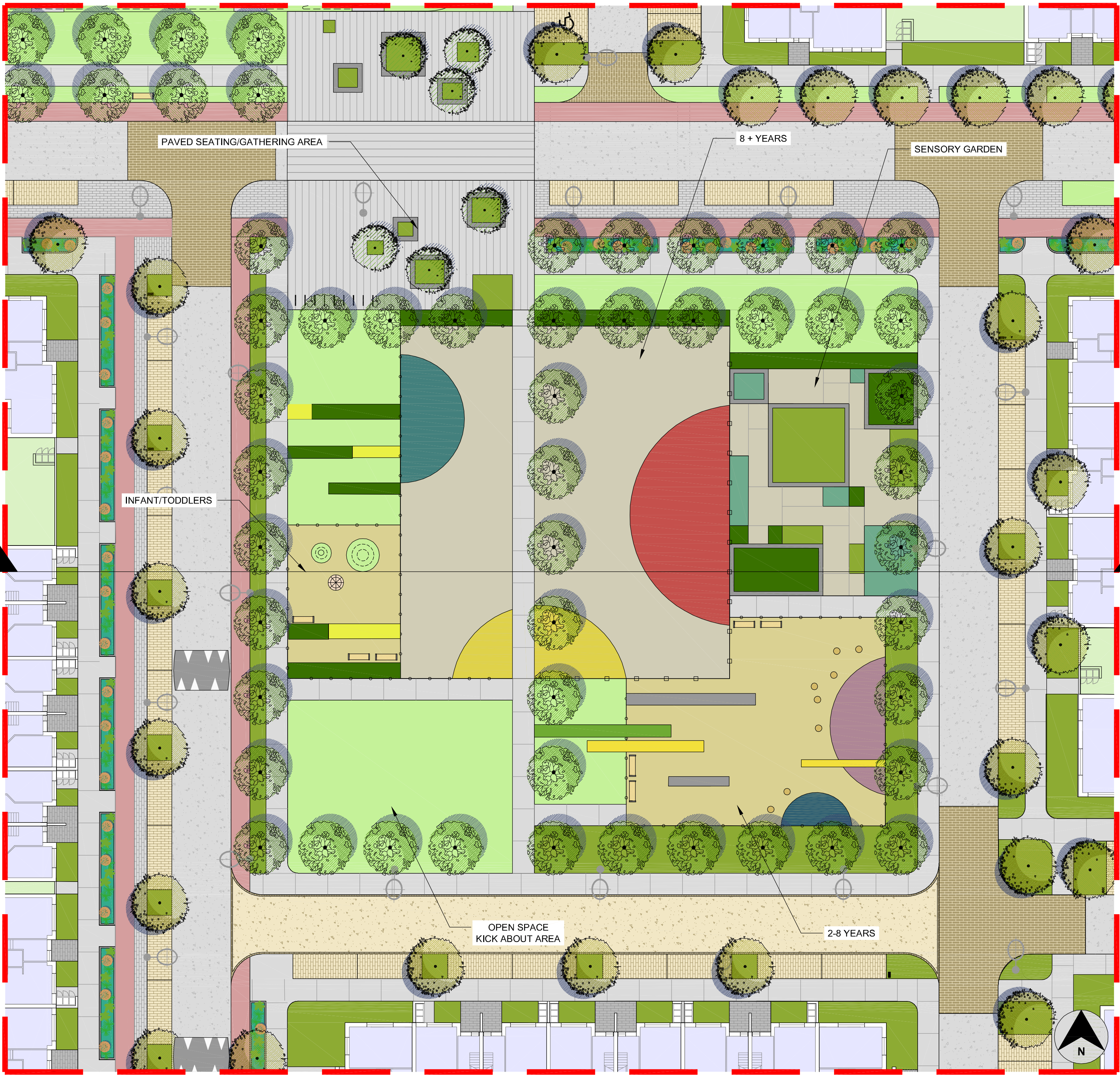
DISTRICT PARK PLAYSCAPE -PLAN VIEW 1:250@ A1