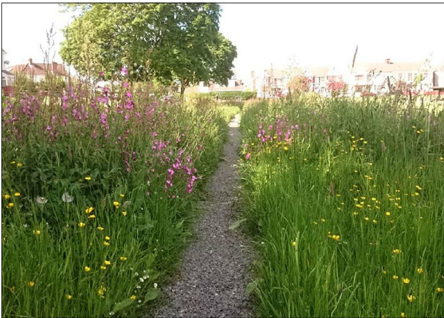
BIODIVERSITY WALK IN SWALE