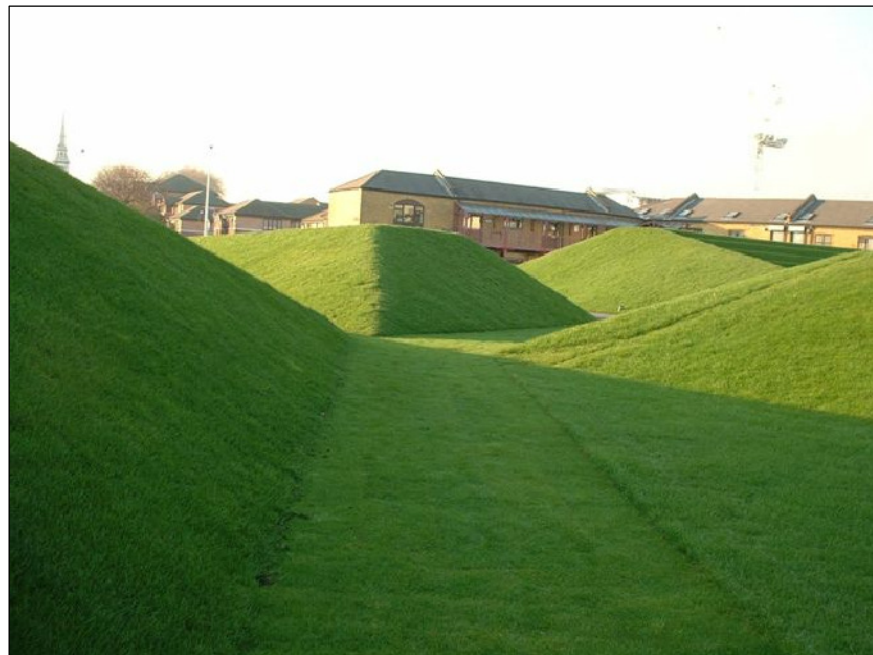
FEATURE FORMED MOUNDS